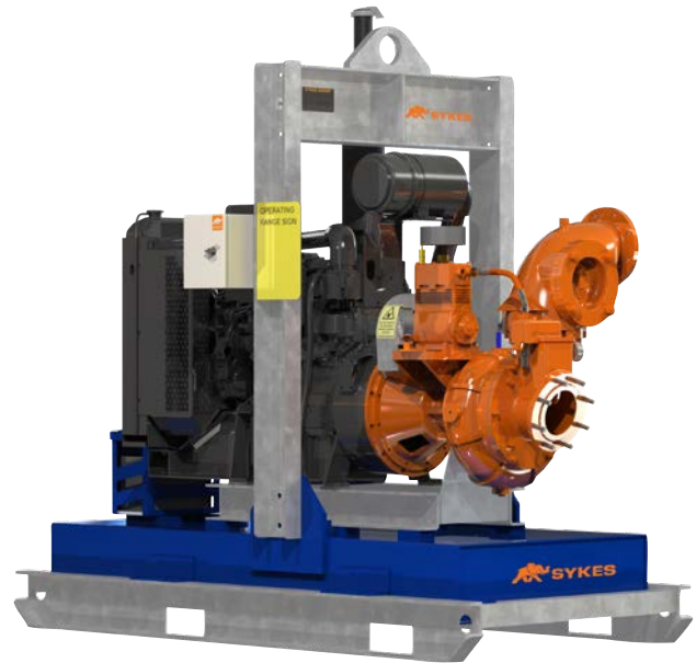
CP TOMBSTONE CURVE