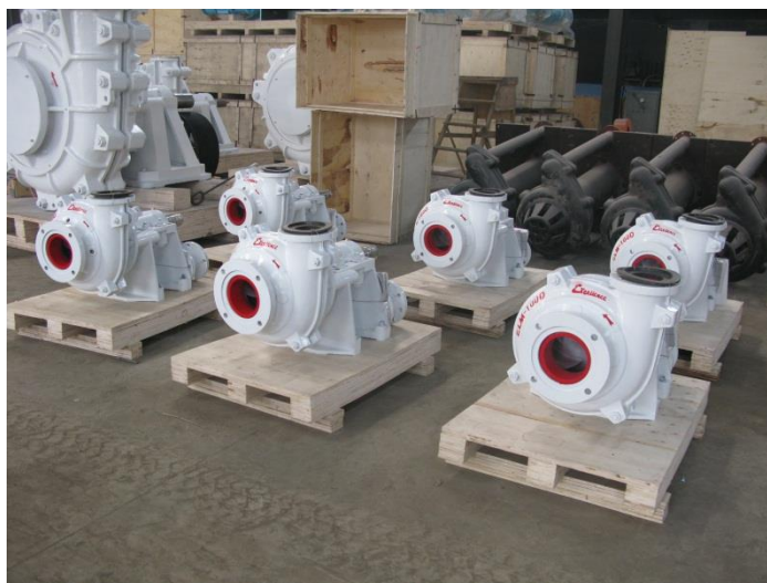
ELM-100D in Cement Plant in Thailand