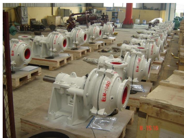
ELM-100D in Wastewater Treatment Plant in Italy