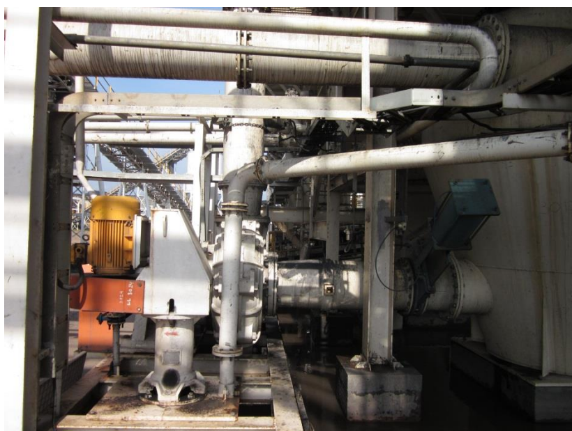
ELM-350S in Coal Washery in Indonesia